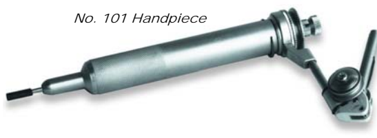
No. 101 Handpiece