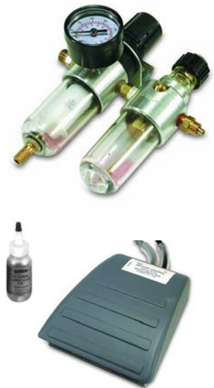
No. 220 Complete System Also Includes Filter/Regulator, Lubricator, Tubing and Oil