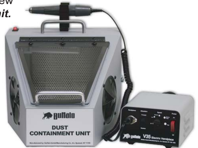
The Buffalo Dust Containment Unit which comes with a V35 Electric Handpiece System