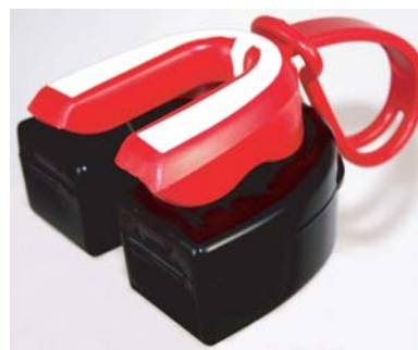
Large Red PLUS Pre-Formed Mouthguard

62989 Small Yellow PLUS Pre-Formed Mouthguard