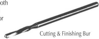
Cutting & Finishing Bur

Item # Description 20000 Cutting & Finishing Bur for Thermoplastic Materials, HP