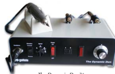
The Dynamic Duo™