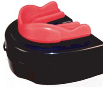
Large Red SSD Pre-Formed Mouthguard

62979 Small Neon Yellow SSD Pre-Formed Mouthguard