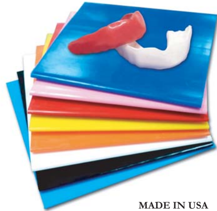
MADE IN USA