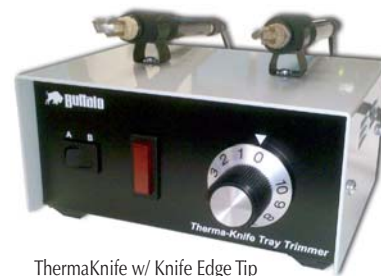
ThermaKnife w/ Knife Edge Tip