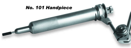
No. 101 Handpiece