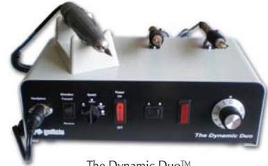
The Dynamic Duo™