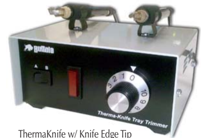
ThermaKnife w/ Knife Edge Tip