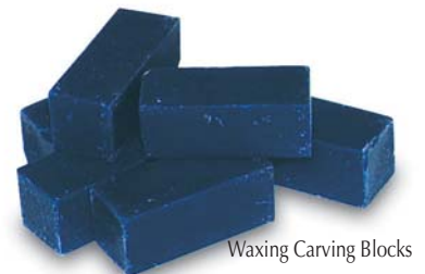
Waxing Carving Blocks