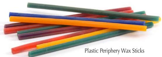
Plastic Periphery Wax Sticks