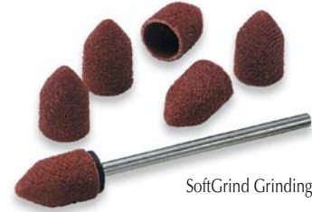
SoftGrind Grinding Sleeves