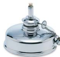
No. 12 Alcohol Lamp