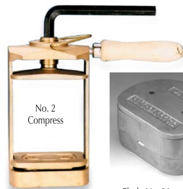
No. 2 Compress