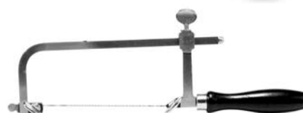
No. 50 Saw Frame