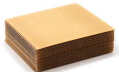
Pressure Sensitive Adhesive Wax