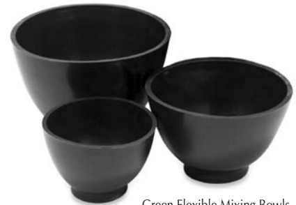
Green Flexible Mixing Bowls