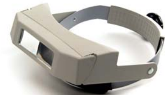
Zoom Scope Binocular