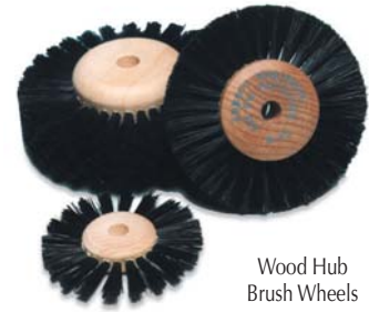
Wood Hub Brush Wheels