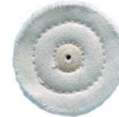
Cotton Flannel Buff