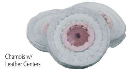
Chamois w/ Leather Centers