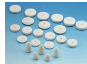
Felt Minim Bufs